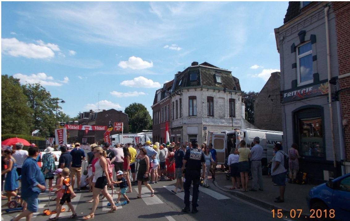
Finishing Strait At Roubaix Stage 9 Of The 2018 Tour De France