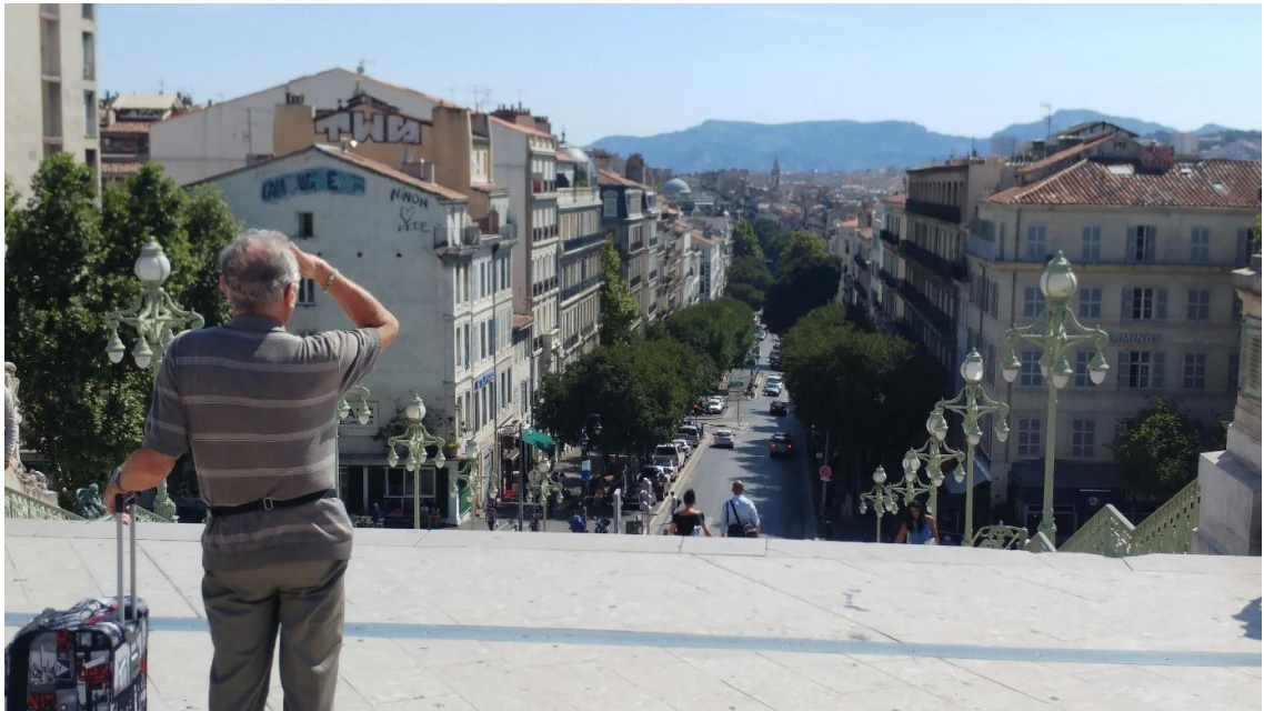
Top Of Marseille St Charles Railway Station Steps