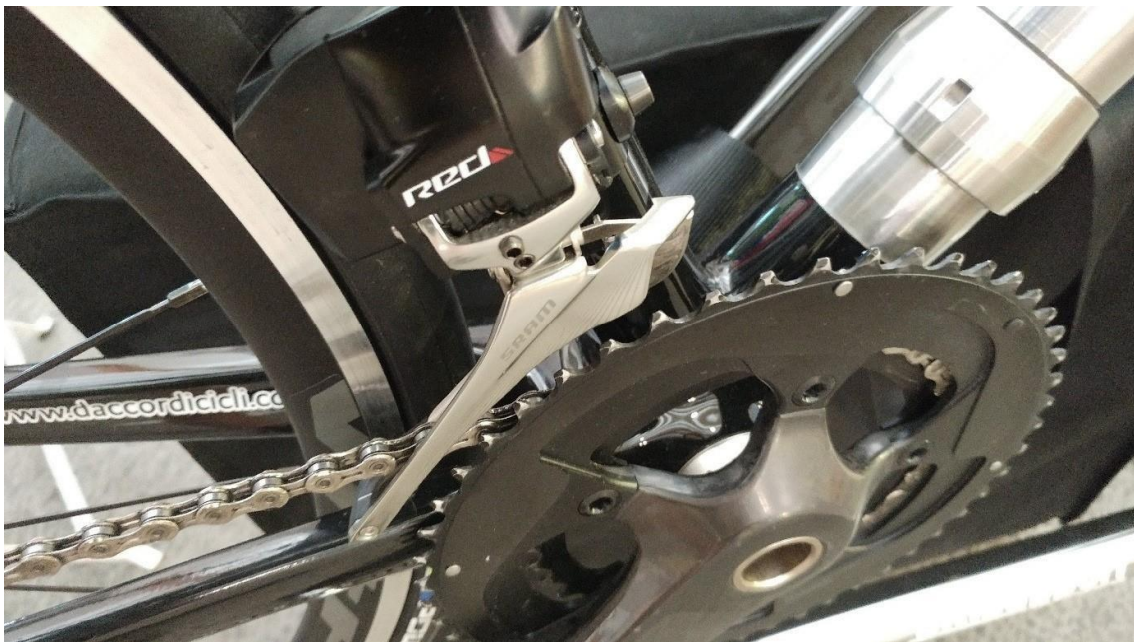
Detail Of Daccordi Bike Above Showing S&S Coupling & Sram E-Tap Electric Motor Powered Front Derailleur. Bike Shown At 2018 Epinal Semaine Federale.