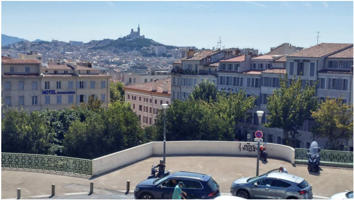
Marseille Skyline from Marseille St Charles Station