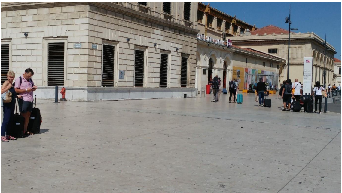
Marseille St Charles Railway Station Front Entrance

the distance is the Notre Dame de la Garde church topped by a statue of the Virgin Mary covered in gold leaf. A very impressive flight of wide steps with 7 landings plus all sorts of sculptures, opened in 1925, gives access to the station from the town.