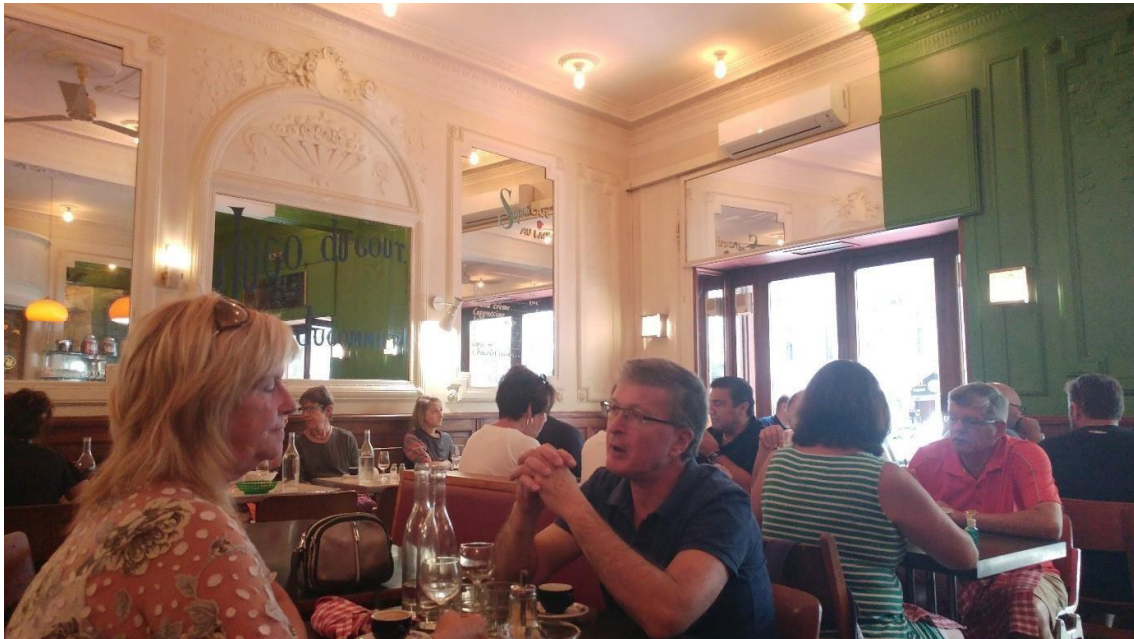
Marseille Comptoir Dugommier Café Interior