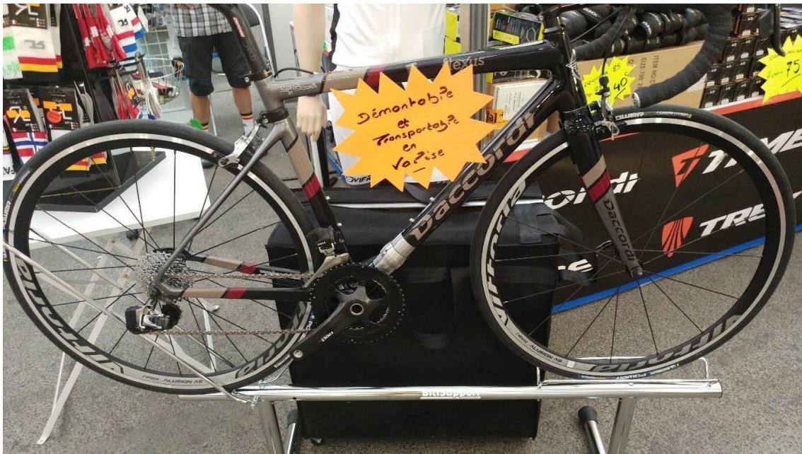
Seperable, Daccordi Steel Frame, S & S Coupling Super Bike With Sram E-Tap Bluetooth Wireless Shifting, That Fits Into Case Behind