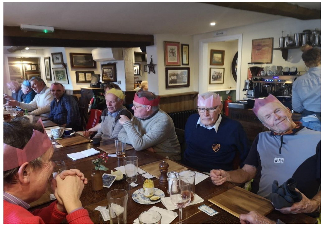
Potterers Christmas Dinner At George & Dragon, Fordwich