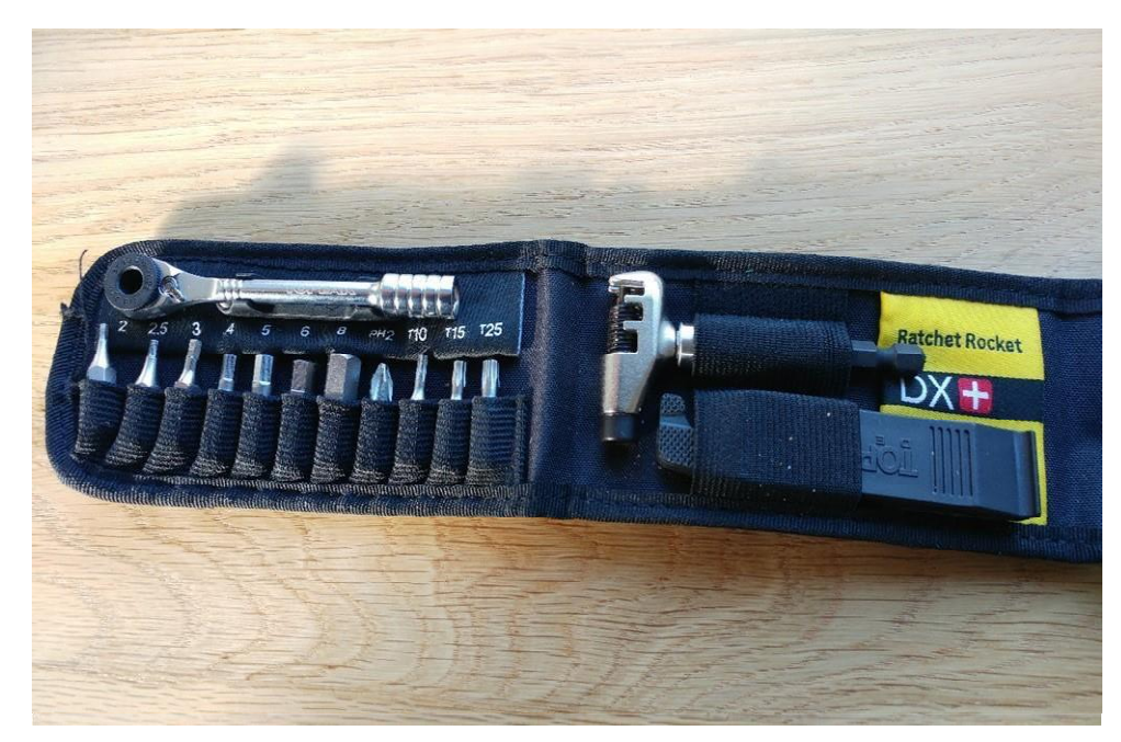
Topeak Ratchet Rocket DX+ Multi Tool